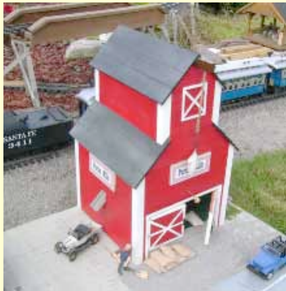
Jack's Purina Mills