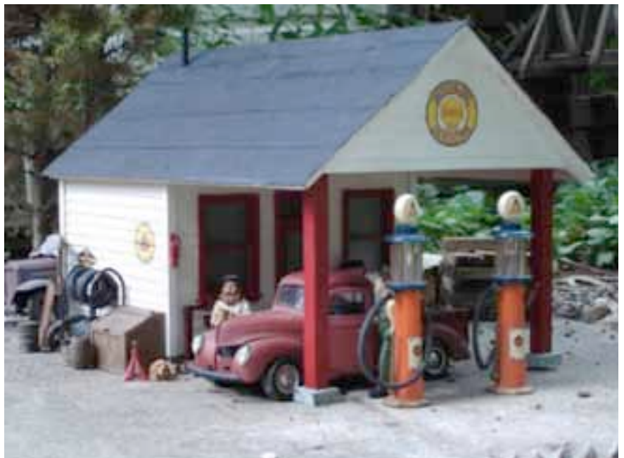
Scratch built gas station on LSOL.com