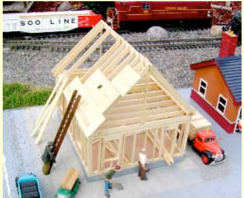
Henderson Construction Company