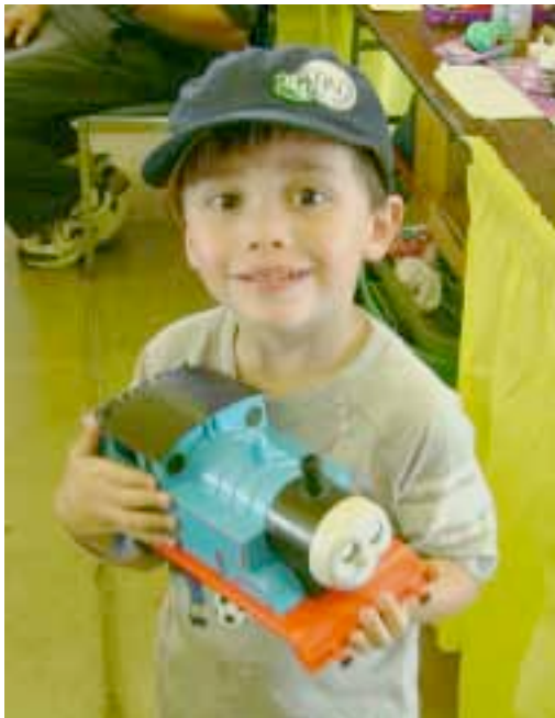
The future of our hobby