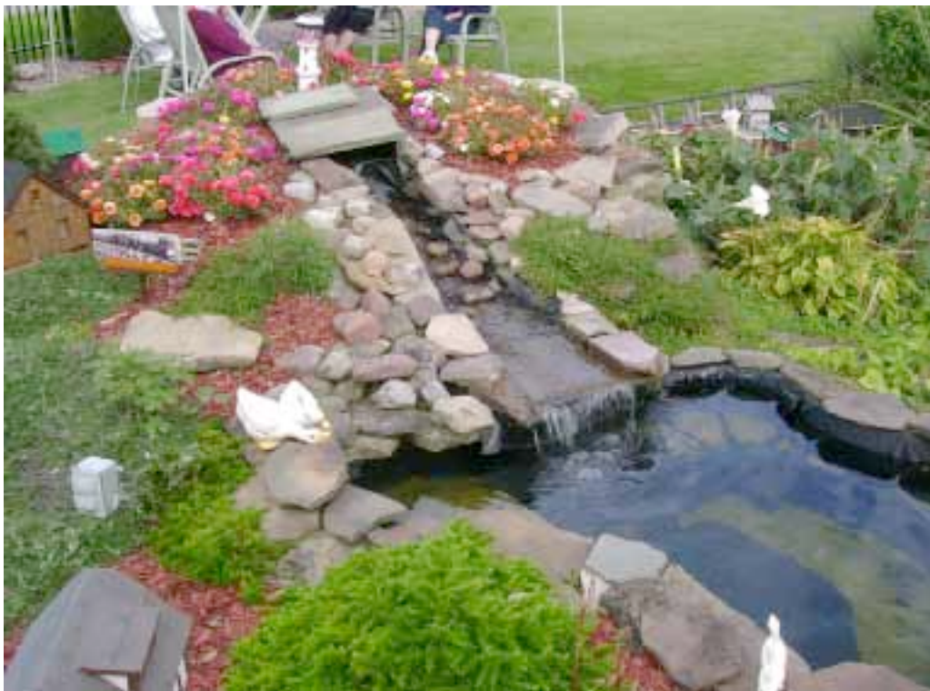
Henderson's Open House 9/11/10