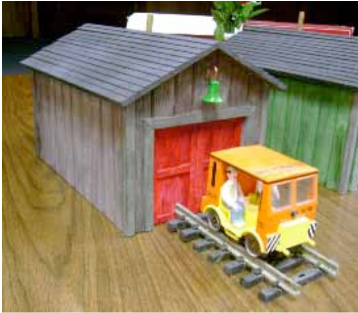
Speeder shed #2/ of 4 scratch built by Dick Mortellaro