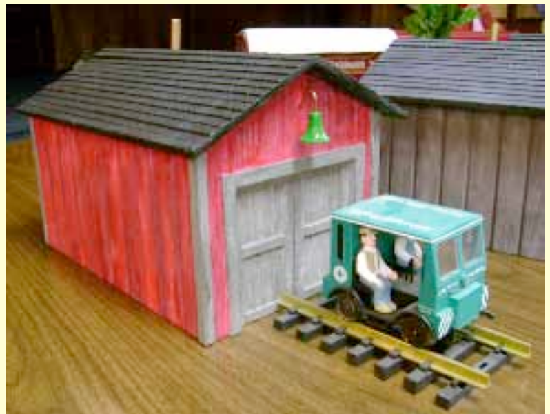
Speeder shed scratch built by Dick Mortellaro