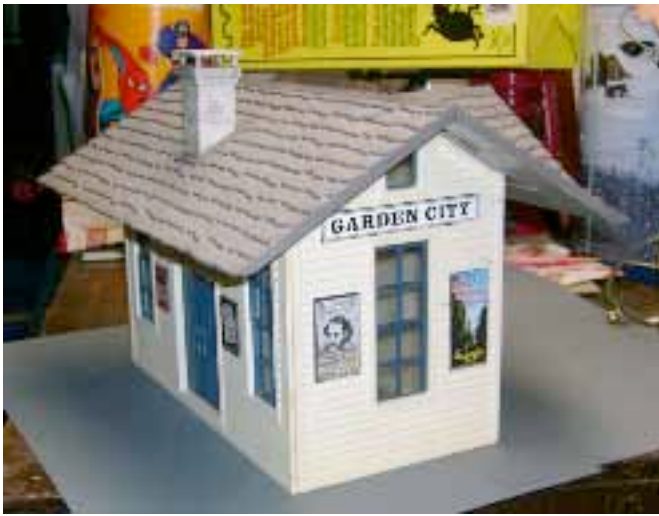
POLA station donated to Ian Cameron.