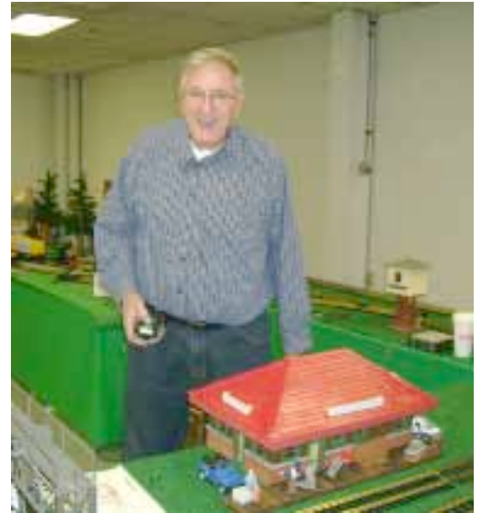
Above: at the Train Show