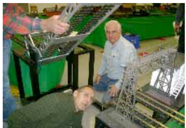
At the train show, November 2010