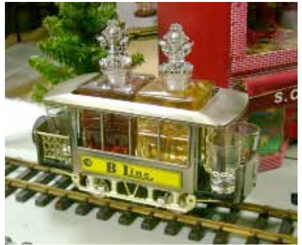
B_Line at Niagara Falls