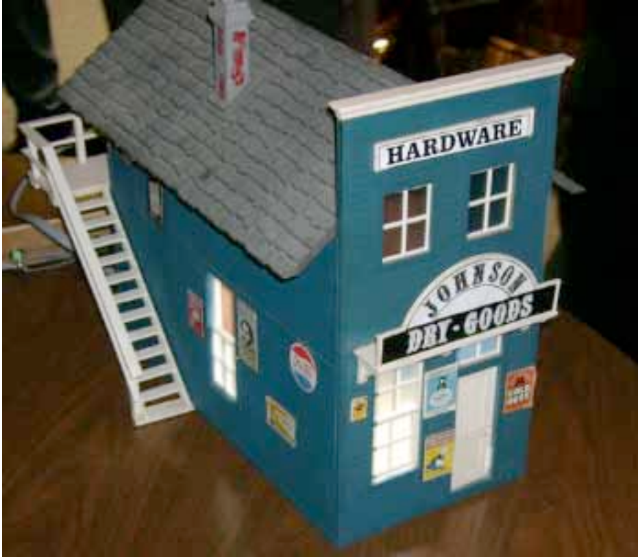
Lit with LED lights by Charles Bartel