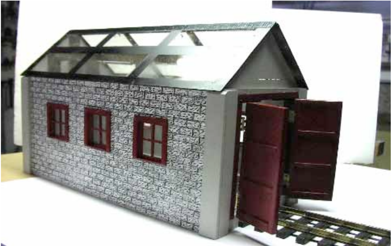
Above: Engine shed built by Gary Ludwig for the Isle of Sodor Thomas display.